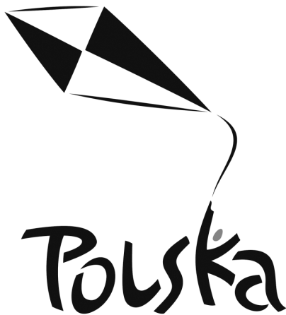
Figure 5.3 Polska kite logo created by DDB Corporate Profiles, circa 2002.