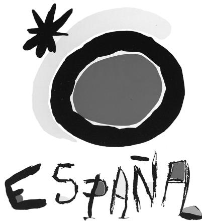
Figure 5.4 Spanish Tourism Institute "Sol de Miró" logo. Courtesy Dirección General de Turismo

The logo and the impact it came to have on the national imagination are widely considered to have been instrumental in the "repositioning" of the country. Once an impoverished and isolated nation emerging from dictatorship, the country now put forward an image of an effective democracy and a cultural and cosmopolitan destination. Indeed, the logo symbolizes Spain's entry into modernity. In particular, Spain's economic development has been widely celebrated. In 2004 the Economist noted that Spaniards "have seen their economy grow faster than the European average for nearly ten years." As of May 2005, Spain was the second most popular tourism destination in the world, a position it has held since at least 1990. Its market share of international tourism arrivals (the percentage of international tourists visiting Spain) has hovered near 11 percent in Europe and 7 percent globally (Ivars 2004, World Tourism Organization 2005). The Tourism